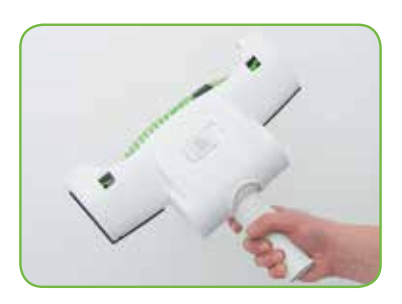
Step 2: Use scissors to remove any hair or debris that may be tangled in the roller brush