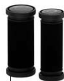
Cool tip base