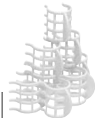
10 white plastic C clips: 5 medium 5 large